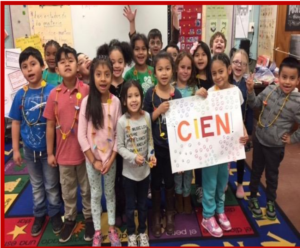
Bay Elementary and Tremont Elementary students celebrating the 100 th day of school