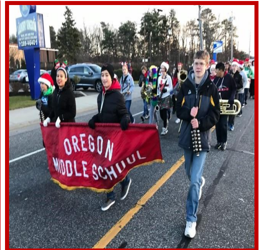
Oregon Middle School students marching in the Medford Holiday Parade