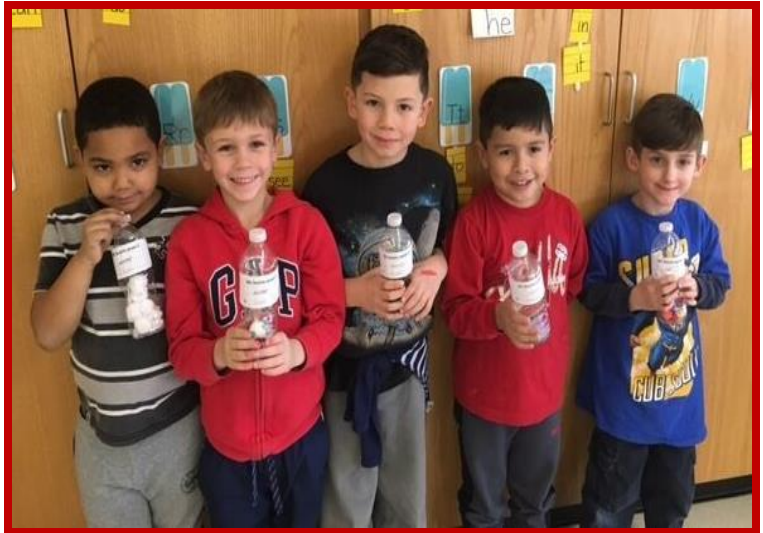
River Elementary students celebrate the completion of a unit on Seasons and Weather and show which season is their favorite.