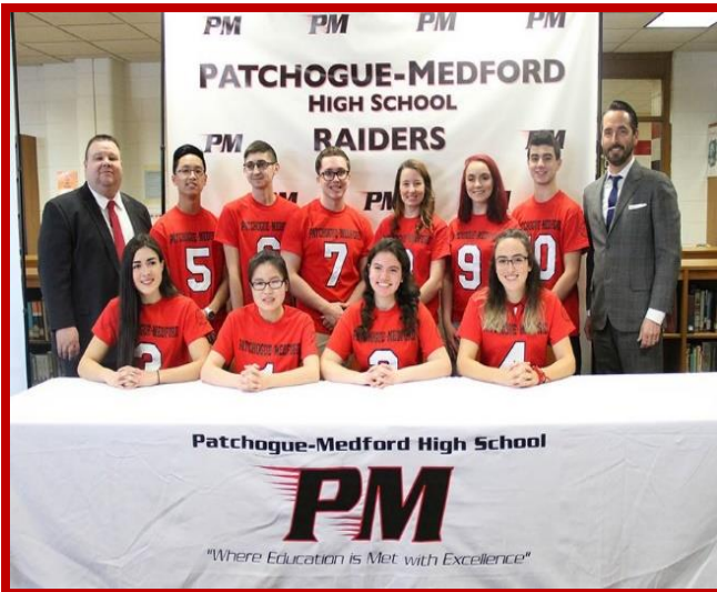
Class of 2017 Top Ten Students