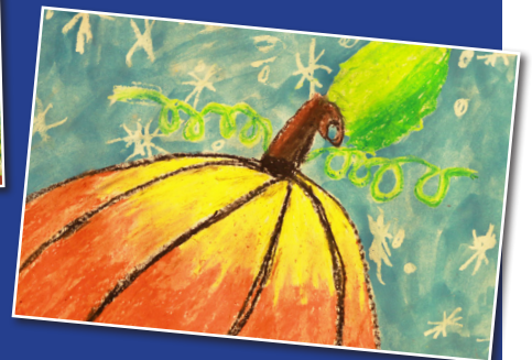
Emma Fielitz, Grade 4 Medford Elementary