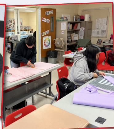
CTE Fashion Design and Merchandising students constructing apparel and accessories.

This year, the Patchogue Medford School District introduced its eighth CTE Pathway at the high school, offering our students an opportunity to pursue a career in the cosmetology industry. Since 2019, our CTE programs have grown with the support of our community and districtwide staff. All of the programs housed in Patchogue Medford High School give students a space to explore a specific career field that has a focus on a targeted industry.