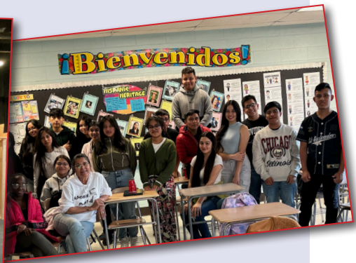
Auditions for the district's first-ever Spanish theater production, coming this April.