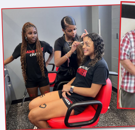
Cosmetology students in our brand-new cosmetology spaces, preparing for Raider Bowl.