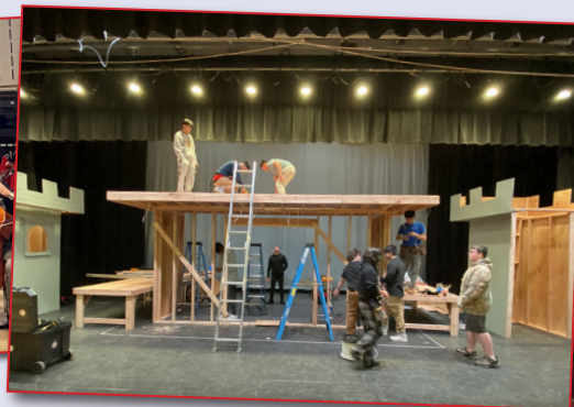
Construction trade students work on the set for last year's production of Spamalat .