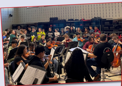
High school pit orchestra and the cast of The Prom in a joint rehearsal. The Prom premieres at the high school on February 8.

Para obtener una versión de este boletín en español, visite el sitio web del Distrito.