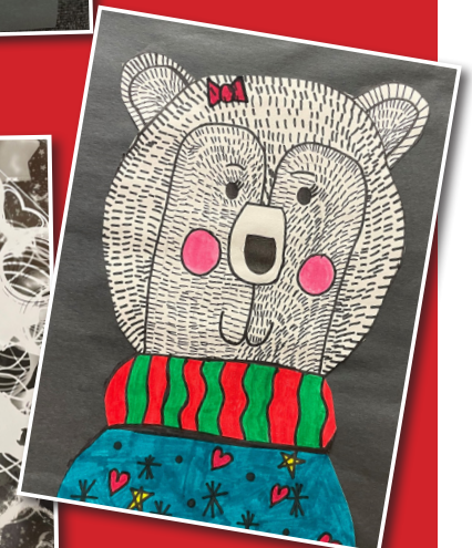
Avery Mattimore, Grade 2 Bay Elementary